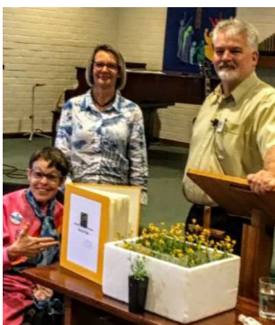
Presenting the 'Seeds Of Hope' book

I cannot express how much of a blessing it was. Certainly after what we have been through this year, with not being able to worship at church for months. I think this gave a boost to our spirits.